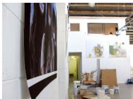
The back-street gallery in the centre of the Gold Coast has room for everyone. (Sara Hicks)